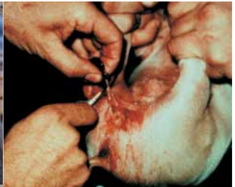
CASTRATION: The piglet's scrotum is cut open and his testicles are ripped out.