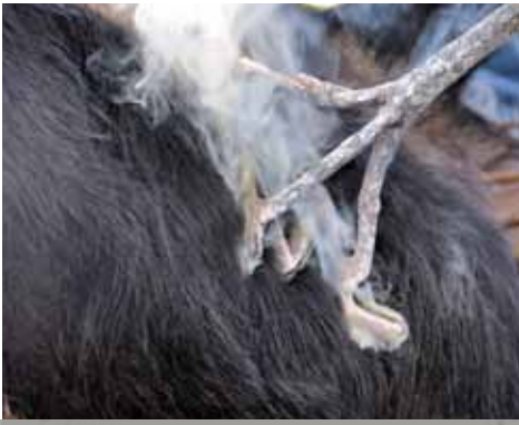
BRANDING: Cattle are branded with a red-hot iron, causing third-degree burns to the skin.