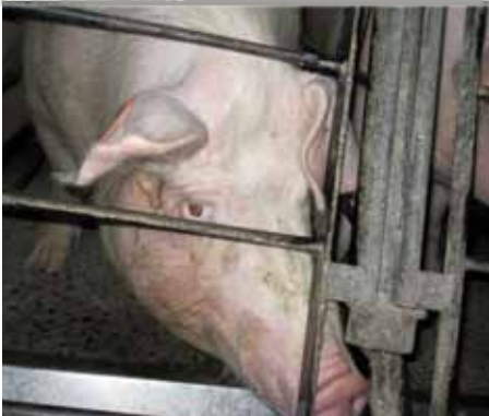
Many sows are confined in cages barely larger than their bodies.