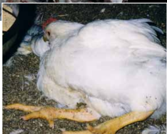
Many birds have difficulty standing, due to leg disorders induced by unnatural weight.

As many as 26% of chickens raised for meat are severely crippled and 90% cannot walk normally by the time they reach slaughter-weight.