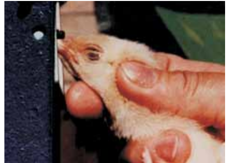
DEBEAKING: Part of the hen's beak is seared off with a hot blade or laser.

In an attempt to cut costs, these agonizing mutilations are usually performed without any painkillers.