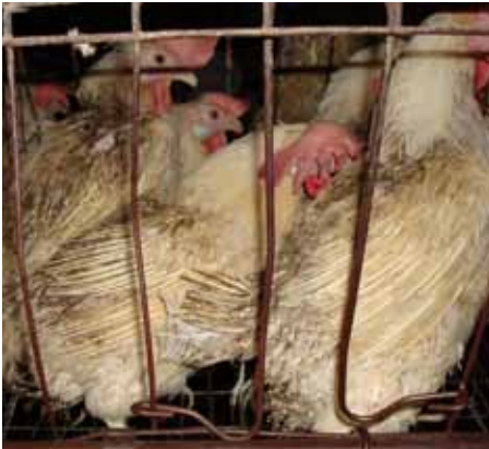
Over 90% of U.S. eggs come from hens crowded into wire cages the size of a file drawer.

Some pigs go mad and exhibit behaviors such as repetitive bar-biting or rubbing their snouts bloody on the concrete floor.